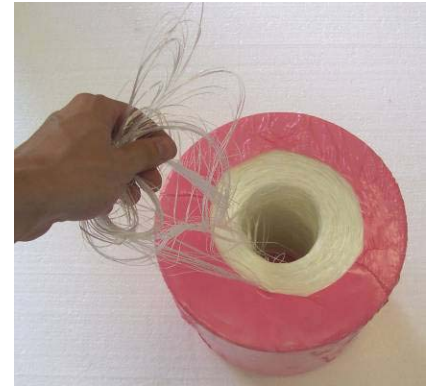
Pull all the mixed strands out of the bobbin until the inside looks well winded.