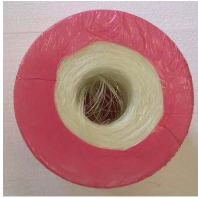
Get the bobbin out of the box