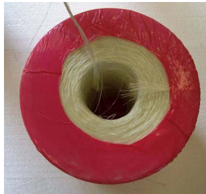
Cut also the strand coming out of the inside to separate it from the mixed strands.