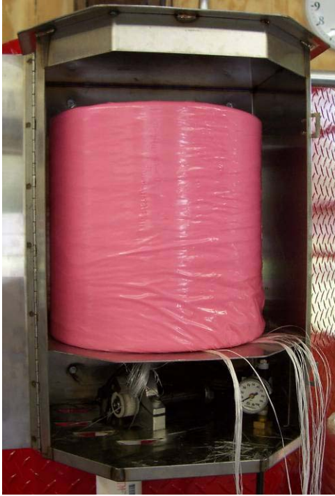
Place the bobbin