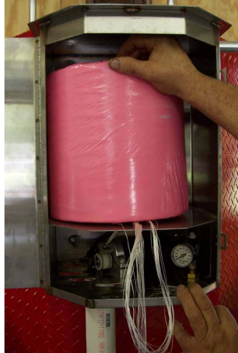
Hold it a little bit while chopping the strand in excess