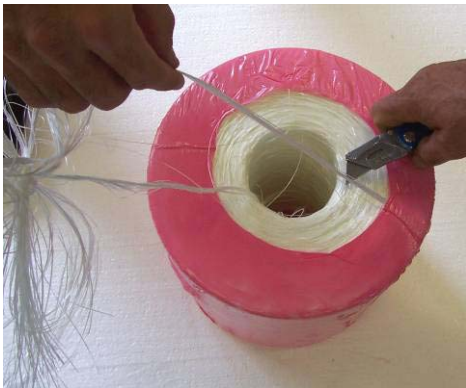
Do not pull out the strand which comes out of the wrap (which is tied with the strand coming out of the inside of the bobbin). Just cut it.