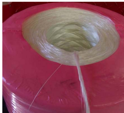
We get now one strand coming out of a "clean" bobbin