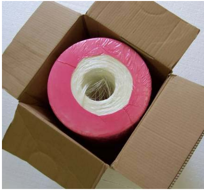
Open the box