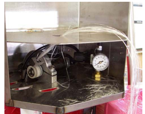
Make pass the strand through the hole from the top to the bottom up to the cutting system. Make sure every single fiber of the strand is introduced in the same hole among the 3 which are available.