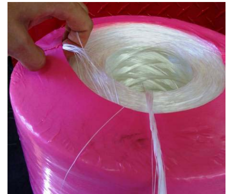
And hide the strand coming out of the wrap under the wrap